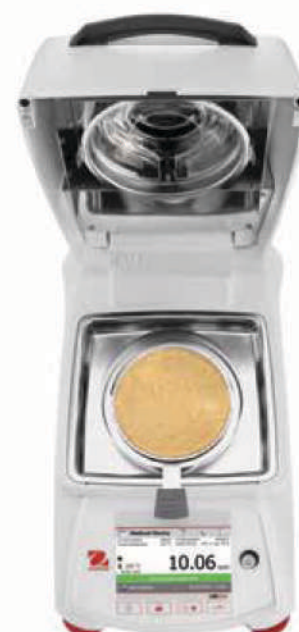
MB120 open with sample